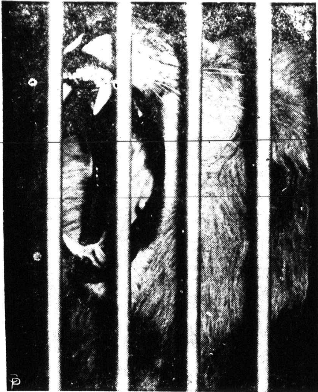
THIS RATIONING BUSINESS is getting Larry the lion down—but not in the mouth as this photo shows. He's raising an uproar because his keepers at the Bronx Zoo only feed him unrationed horse meat. Part of the noise may be blamed, too, on the rise in the cost of food. In the Zoo's 1944-45 estimates it was discovered that $53,000 will be needed to feed the birds and animals, $13,000 over last year.