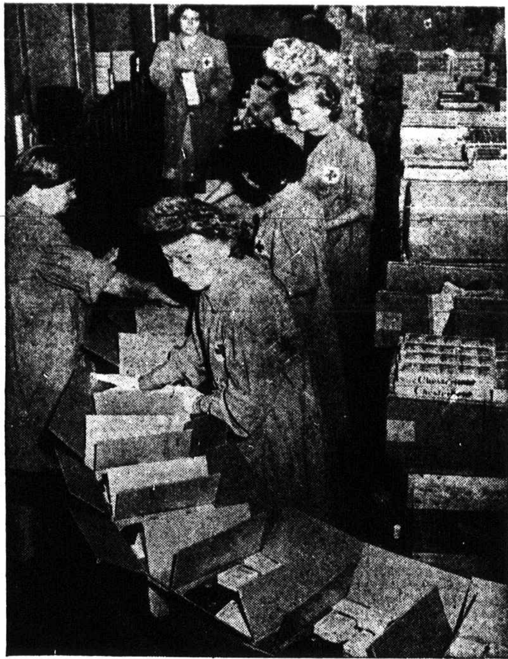
FOR WAR PRISONERS—Corner of the Prisoner-of-War food packaging center in Chicago. Here on a conveyor system, by mass production methods, thousands of parcels are packed each week for war prisoners. Three other centers also are operated by the Red Cross.