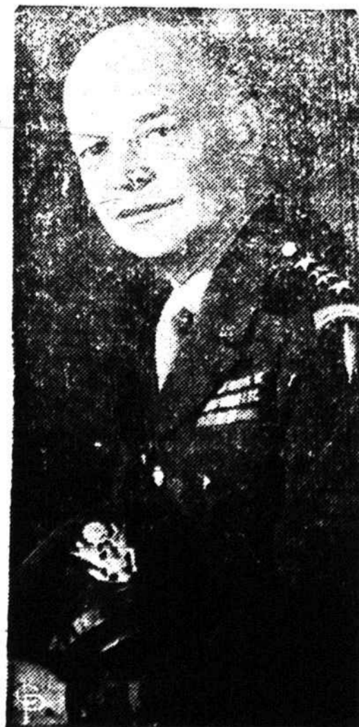
THIS latest portrait of Gen. Dwight E. Eisenhower has just been officially released by the U. S. Army photographers.