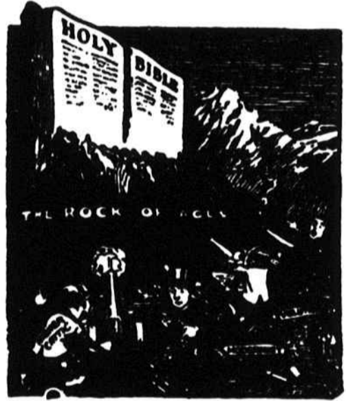
The Old Book Stands

MOORE'S DRY CLEANERS J. D. MOORE and LEE WALKER In Bus Station Building