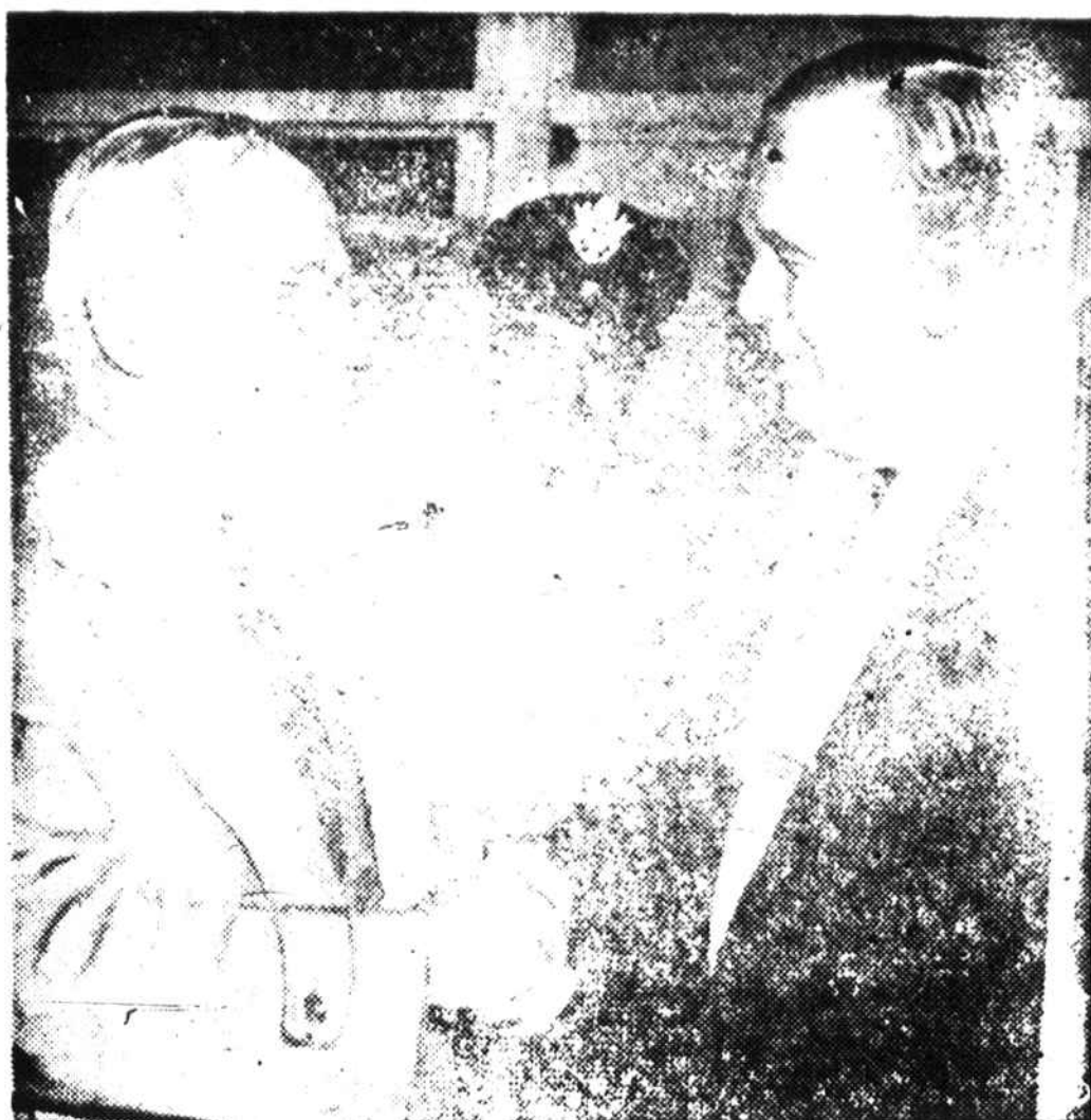
A CORDIAL HANDSHAKE is given Secretary of State George Marshall (right) by President Harry S. Truman following the former's arrival at Washington Airport. The Secretary flew in from Paris for a series of conferences on foreign affairs at the White House.