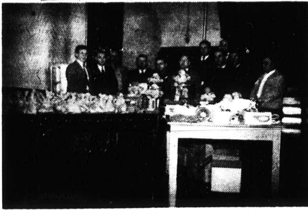
Shown above is a group of Sylva Lions just after having completed the job of wrapping gifts and preparing fruits and candy for 82 persons to receive packages from the club. This is an annual project of the club which brings joy and happiness to many who would not have the usual Christmas cheer.