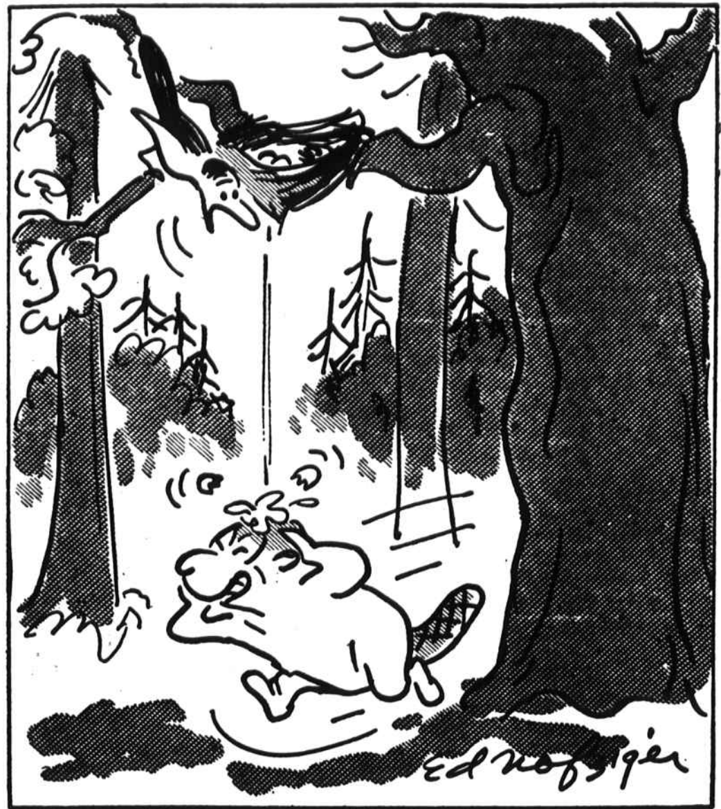
Forest Service, U. S. Department of Agriculture "TIMBER-RI"