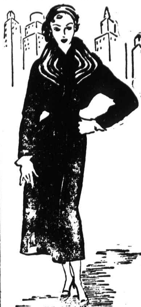
Navy blue with fur trim.