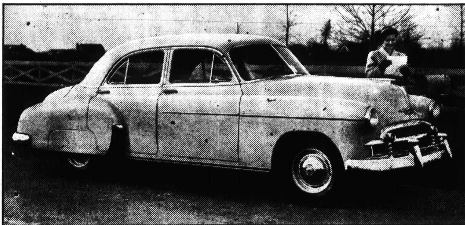
The Styleline, one of two individually designed sedans which have achieved immense popularity with Chevrolet owners, will have new beauty in 1950. Improved grille work, sturdier bumper guards and more tasteful ornamentation are some of the exterior improvements. New Chevrolets also offer increased power and comfort with the Powerglide automatic transmission as optional equipment on De Luxe models.