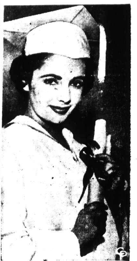
FILM ACTRESS Elizabeth Taylor is shown in her cap and gown before attending graduation ceremonies at University High School, Hollywood. The actress attended studio classrooms for the past nine years, but graduated with the class at the public high school.

2:30 p.m.—Athletic Events Begin. 4:45 p.m.—Assembly—Announcement