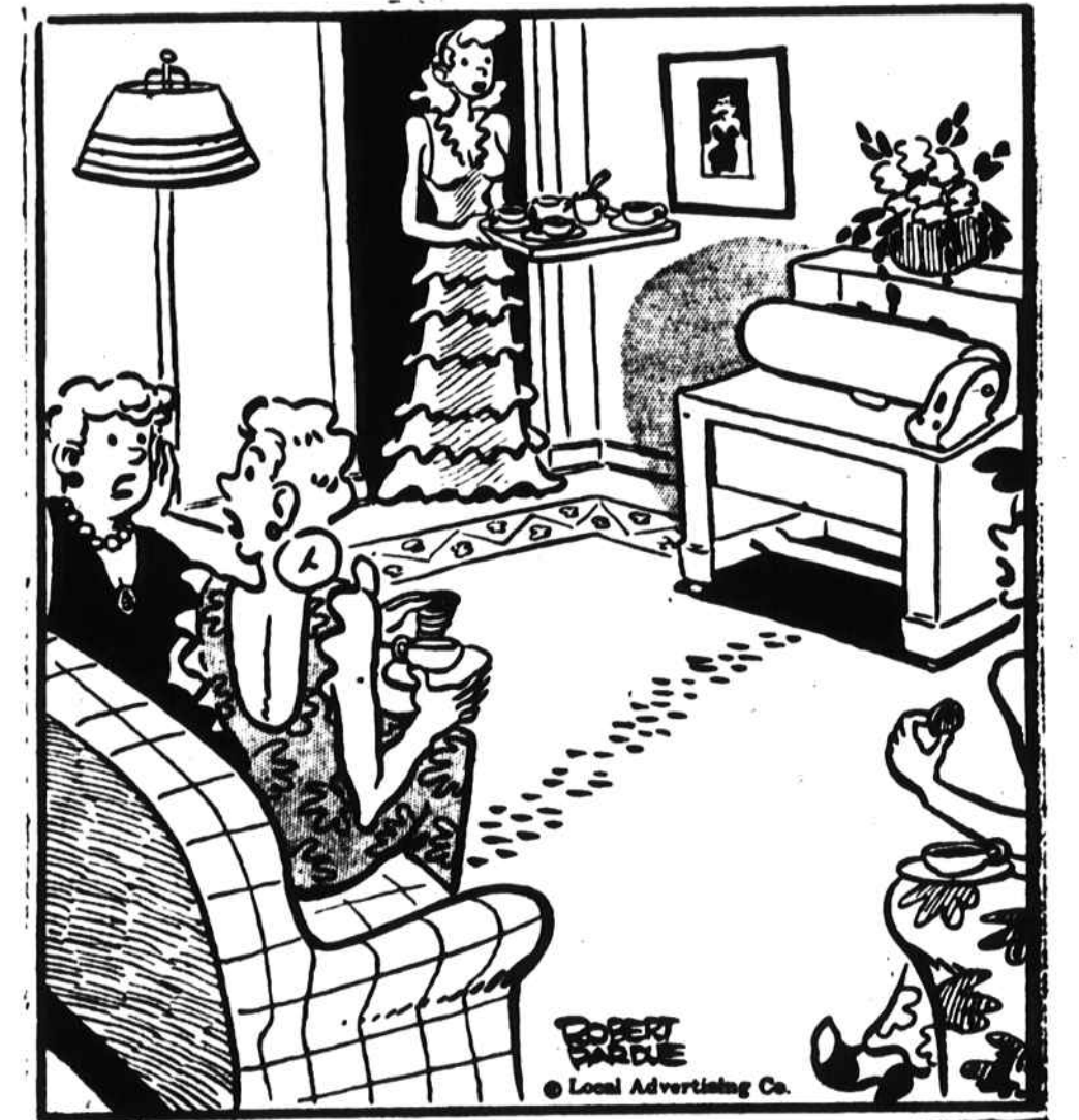
"She just had this tea to show off her Maytag ironer and living room furniture from JACKSON FURNITURE CO."