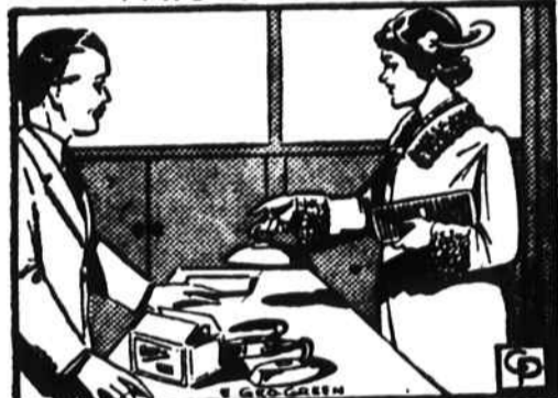
When you are buying an electric iron, try it for weight. An iron weighing no more than four pounds saves energy in lifting.