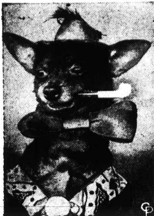
NOTHING could be doggier than a pipe-smoking pooch, rigged out in a huge bow-tie and wearing the look of an expectant prize-winner. The pup appeared at the Miami, Fla., Dog Show.