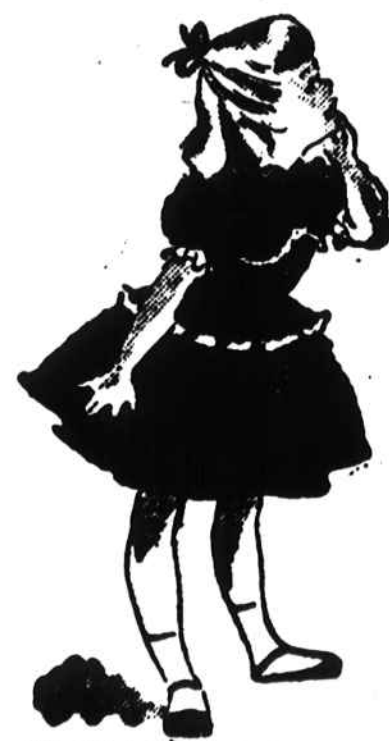
In Plaids and Pastels