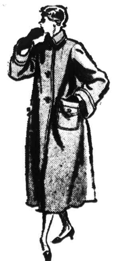
100% Wool — Full backs