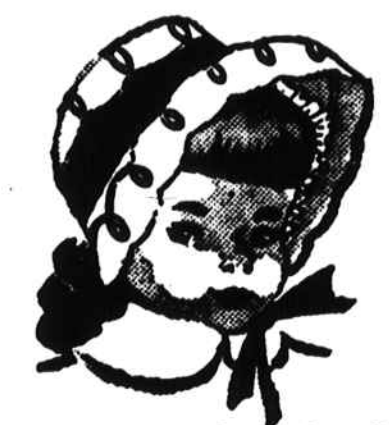
Embroidered Organdy Pique, Pastel Shades, Checked Gingham.