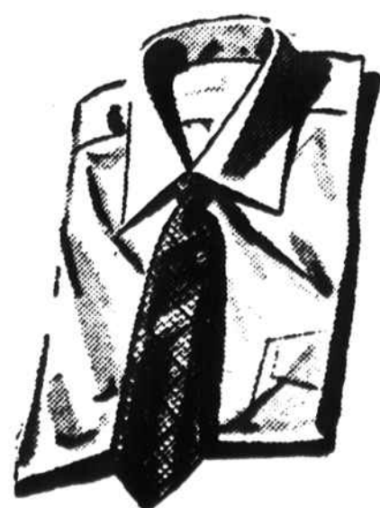
White, with Aeroplane cloth collar guaranteed to outwear the shirt, and Stripes