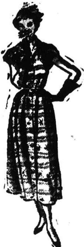
Chambray, Faille, French Crepe.