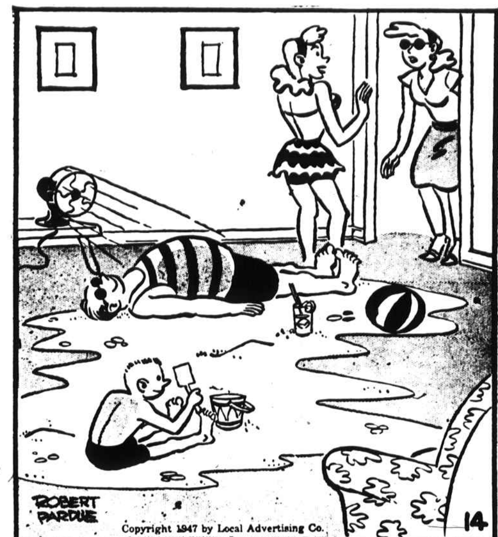
"We decided not to go anywhere this year, since we bought a new fan from JACKSON FURNITURE CO."