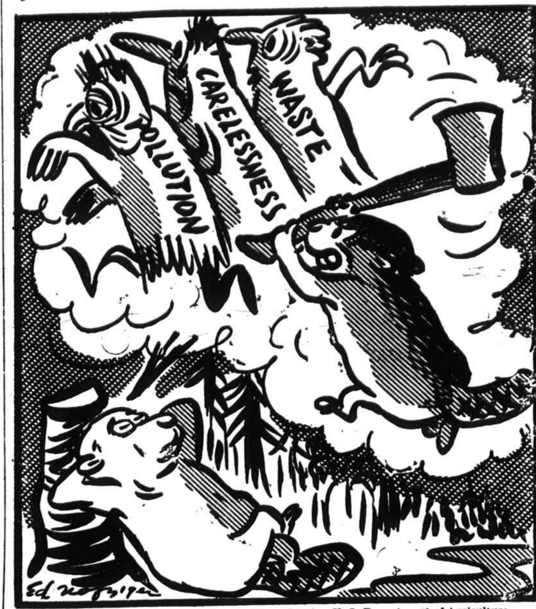
Forest Service, U. S. Department of Agriculture