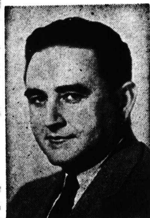
GOVERNOR W. KERR SCOTT will head the list of state officials who will attend the 12th Congressional Democratic Rally here on October 4.