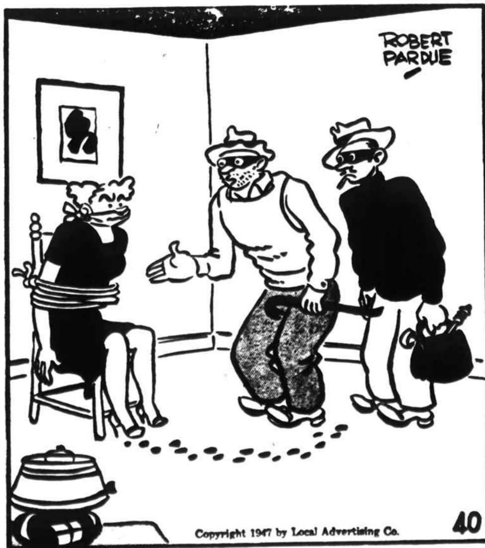
"We don't want your jools, lady—we heard you have a Frigidalre deep freezer and new lamps from JACKSON FURNITURE CO."