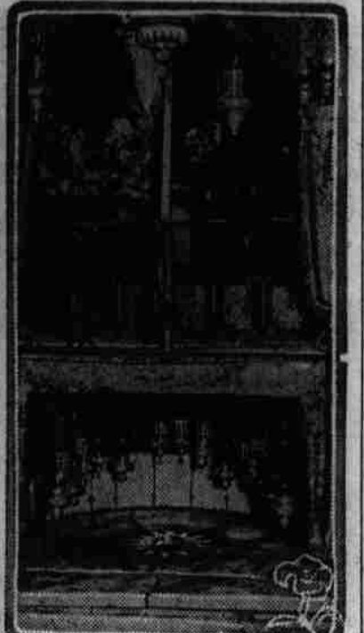
The Grotto of the Nativity in the crypt of the church of the Nativity at Bethlehem. The star beneath the altar marks the supposed place of the Nativity.

The throng of Easter pilgrims from the whole Christian world is a very remarkable sight. To the Westerner it is a revelation of oriental Christianity in all its picturesque devotion. Greeks from all over the Levant, Armenians from Turkey, Persia and Caucasus; Nestorians from the Mesopotamia and Persia; Syrians from Aleppo, Damascus and Beirut; Abyssinians from northeast Africa; Copts from Egypt, and men from the ancient