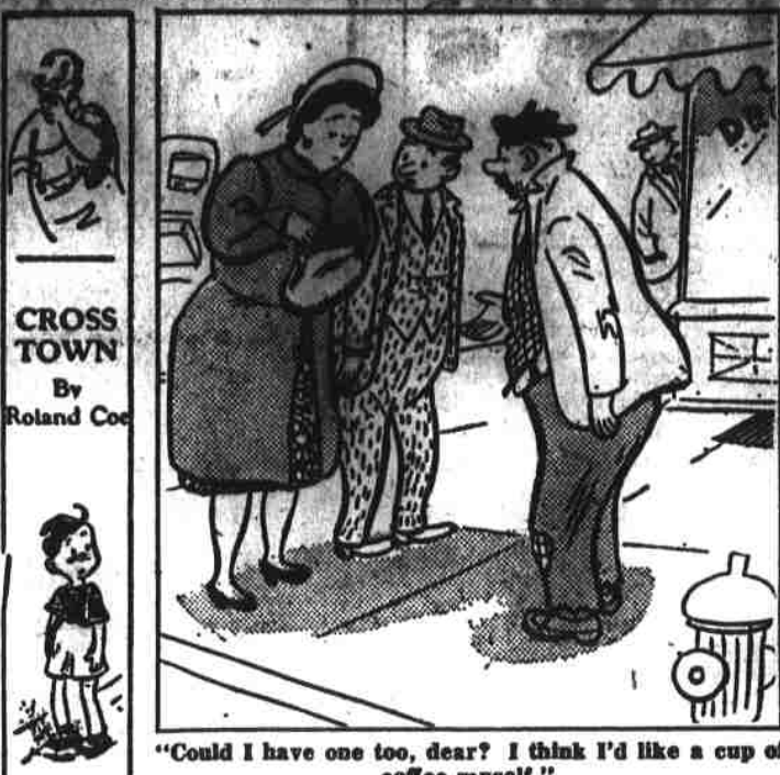
CROSS TOWN By Roland Coe