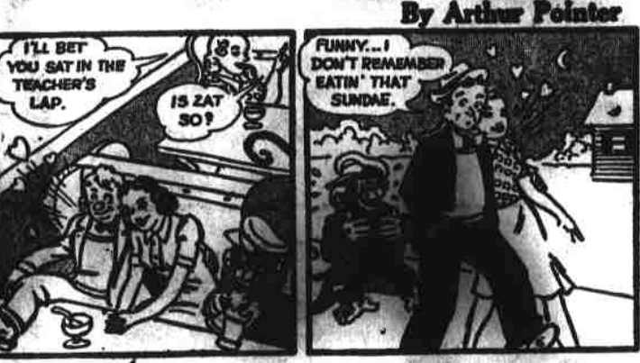
By Arthur Pointer