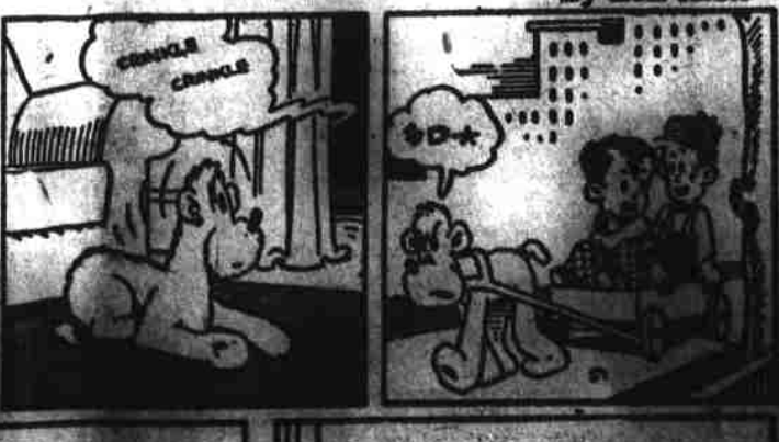
By Len Klein