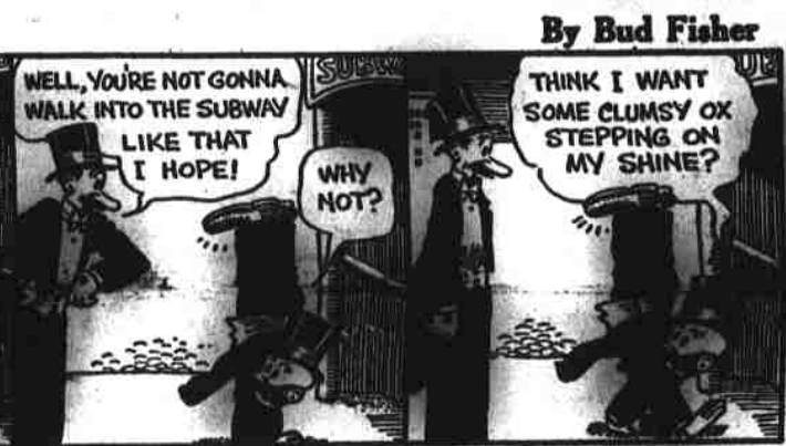
By Bud Fisher