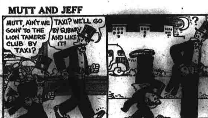
MUTT AND JEFF