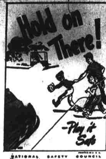
NATIONAL SAFETY COUNCIL