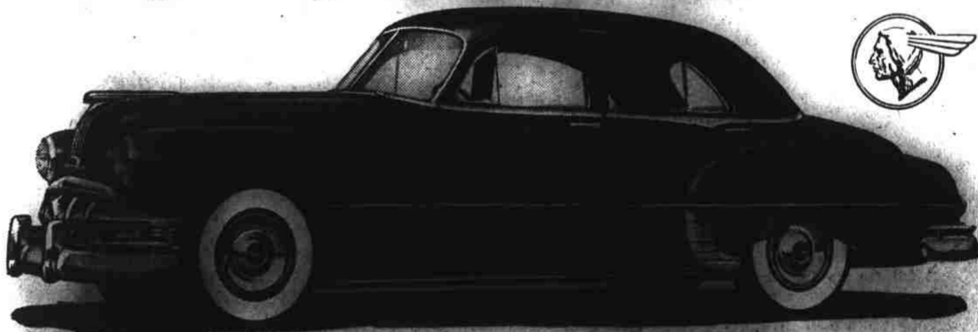
Chieftain DeLuxe 4-Door, Six-Cylinder Sedan (including white sidewall tires and bumper using guards)

All that's Good and Desirable in a Fine Car!