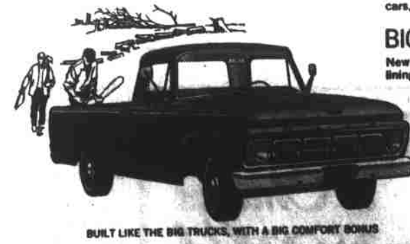
BUILT LIKE THE BIG TRUCKS, WITH A BIG COMFORT BONUS

BIG NEW SAVINGS New self-adjusting brake! New, up to 32% longer living life! New double-life muffler, tailpipe!