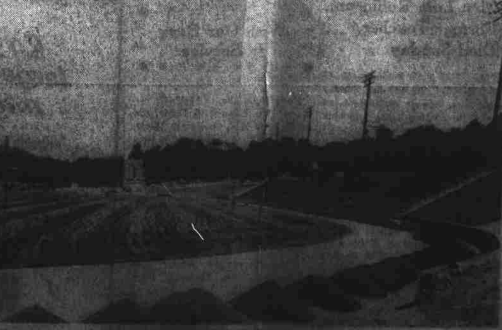
Pictured above is Mars Hill College's new stadium with a beautiful new turf, 3,500 permanent seats, a handsome new scoreboard and other facilities. The stadium and turf will be used for the first time at homecoming on October 9 in a game against Carolina-Newman. (Continued on Last Page)