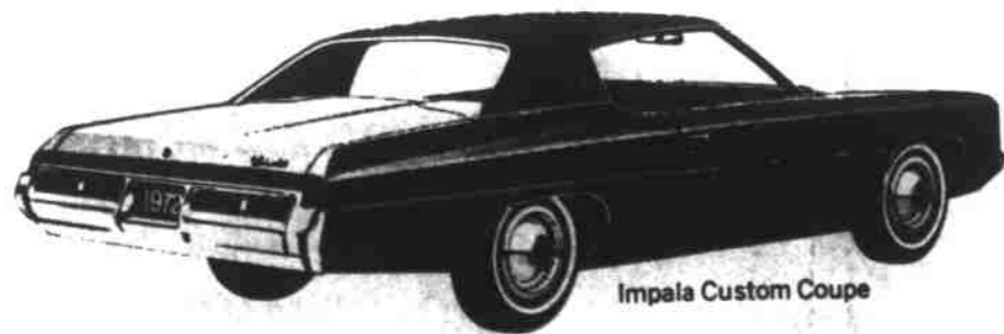
Impala Custom Coupe

BUT—They Are Available Now For Immediate Delivery