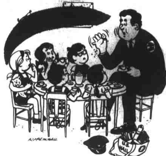
"...So there I was - all alone in Mr. Wilson's yard, surrounded by thirty-five vicious dogs, when..."

The above comments appear each week to air thoughts, opinions, and information we believe to be important to our friends and customers — your comments are welcomed.