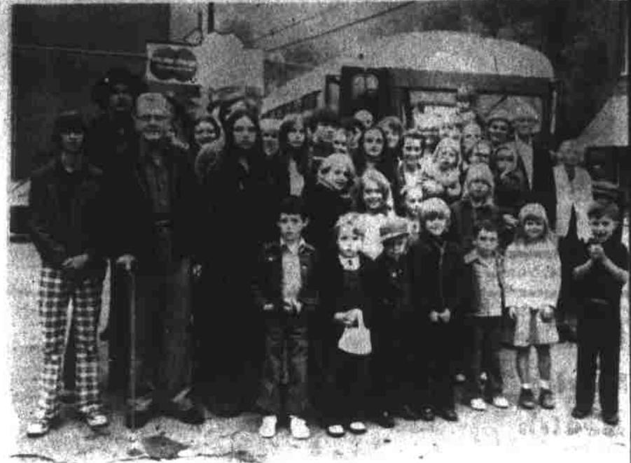
CHEROKEE BOUND — The above group are members of the Community Free Will Baptist Church of Marshall who visited the Cherokee Indian Fair last Saturday. Behind the group is the church bus which they use for various activities.

The major areas of emphasis of Target '76 will be on targeting (the gathering and uniform analysis of past precinct election results), voter registration, volunteer recruitment and Get - Out - The - Vote activity.