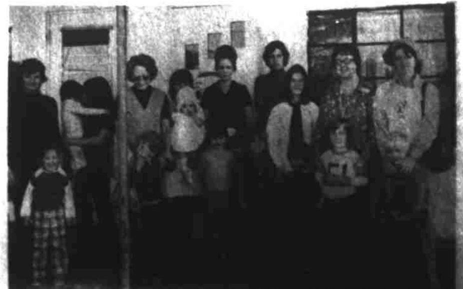
A DELICIOUS THANKSGIVING DINNER was enjoyed at the Marshall Day Care Center last Thursday when the children with their mothers (and grandmothers) united for the meal. Part of the group enjoying the occasion are pictured above.