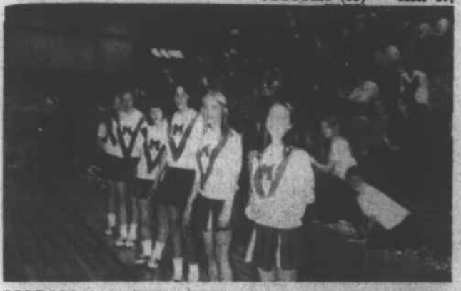
MADISON CHEERLEADERS, shown above, did everything they could to help bring on victory Saturday night. They have done a splendid job all season.