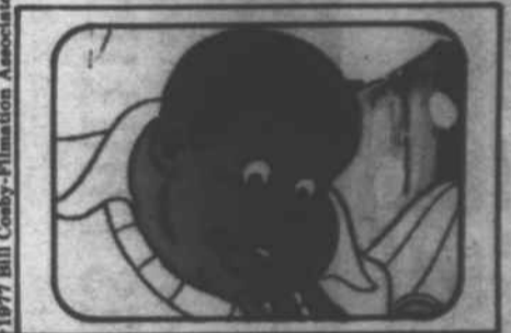
Fat Albert is returning.