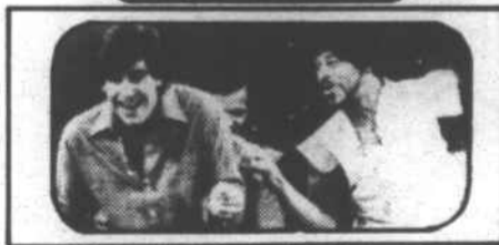
Kids Are People Too will continue on Sunday mornings.