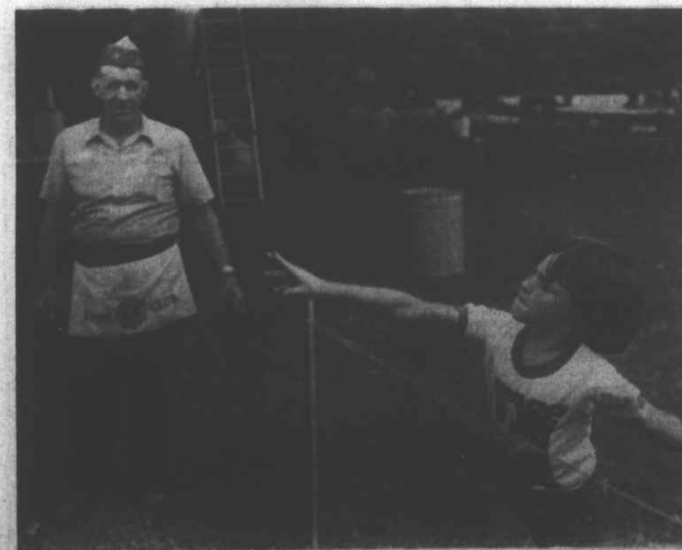
A LION-HEARTED dart thrower aims for six target balloons at the

right, is the only one-armed man he knows of to slap a string bass — and he says there is none better than he's heard. The music was sponsored by the Trail Cafe.