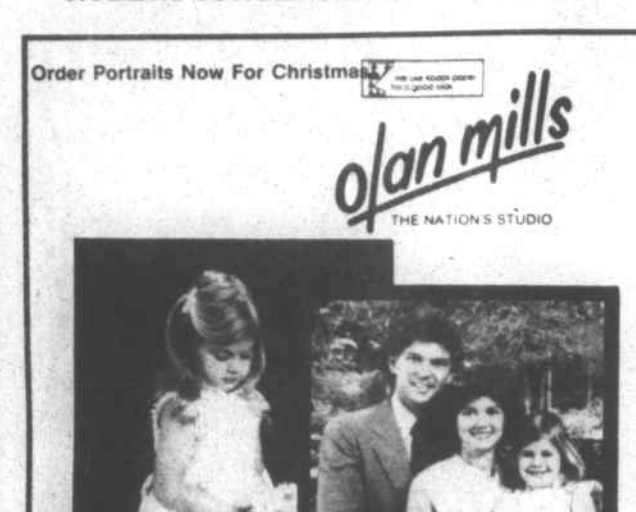
11x14Color Portrait - $1.50

Your choice of Family Group or Individual One special offer per family, one per person ALPINE COURT THURSDAY, SEPT, 13th PHOTO HOURS: 1:00-9:00 PM HOT SPRINGS, N. C.