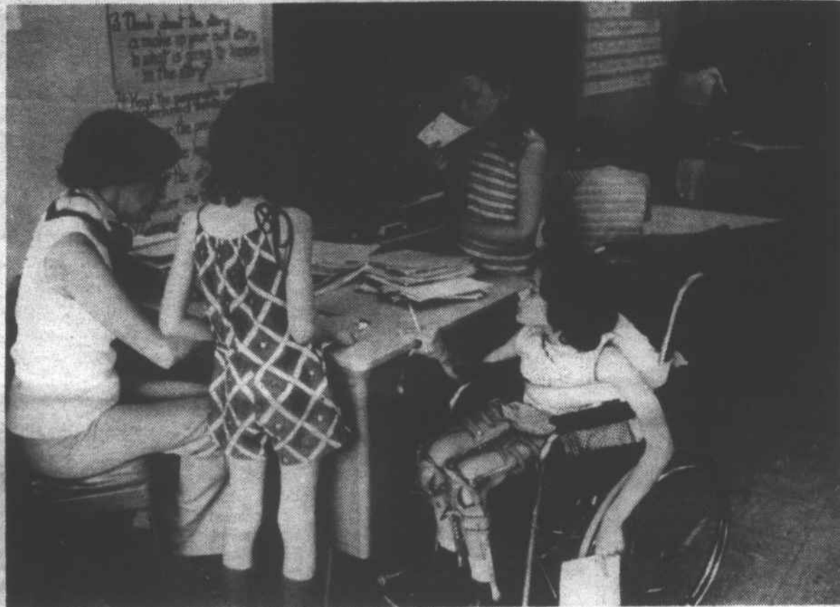
Handicapped students are entering regular classroom activities.

Check the boxes if these things are going on in your school.