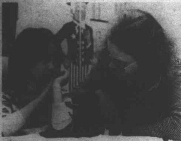
A student talks with her teacher.

Bilingual (two-language) education. Some students do not understand English well. So they will not get behind in their work, these students are being taught in their native language as well as in English. The hope is that they will soon be able to join the regular classroom.