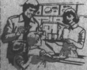
PLATE DINNERS SHRIMP, CHICKEN, AND BAR- B-QUE HAMBURGER AND CHEESEBURGER PLATES TOO!

Beat The Heat! Bring The Family To Eat Where It's Cool With Quick Service.