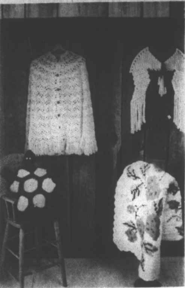
MACRAME, weaving and soft sculpture are just some of the many crafts on display at Penland and Rabb's business.