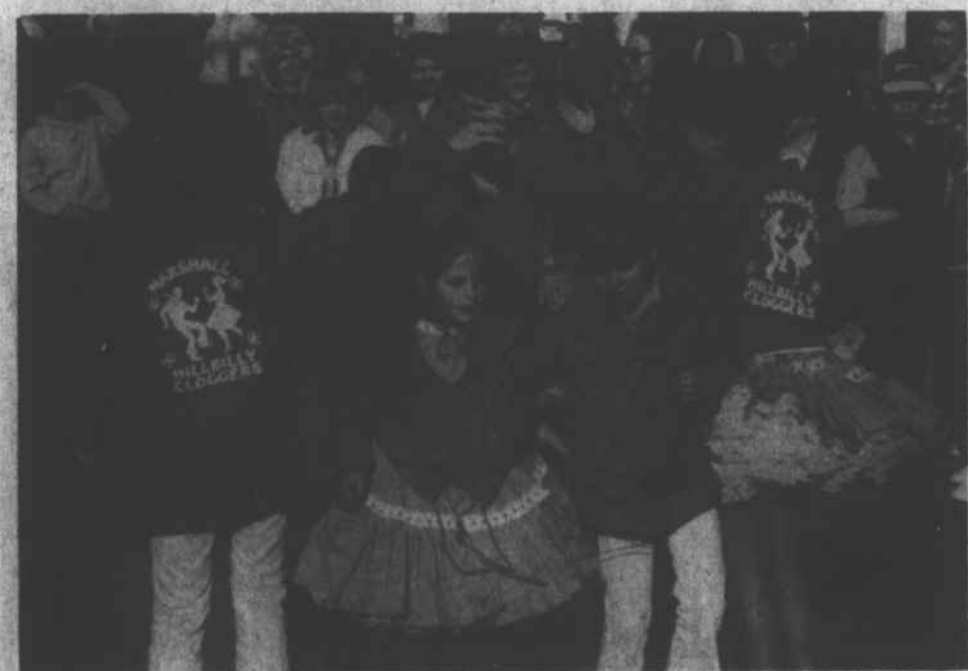
PARADE SPECTATORS gathered around the intersection of Main and Bridge streets to