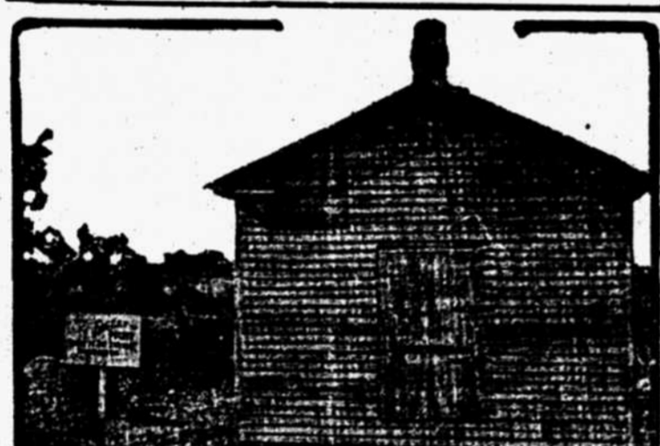
AN EXCELLENT TYPE OF STORAGE HOUSE FOR POTATOES.

Though North Carolina produces a good crop of sweet potatoes each year, a conservative estimate places the loss due to poor storage facilities at 50 per cent of this crop.