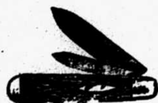
Pocket Knife Bargain .....$1.00

Our store is one of the largest devoted to any purpose in North Carolina. The main building is the handsome three-story and basement structure you see at the corner of Wilson Avenue and Broad Street. You can't miss it when you come through the main street of Dunn. Our several warehouses are located in different parts of town. They as well as the main building are filled with goods that you will need before another crop is planted. If you are wise you will buy before we are forced to raise prices.