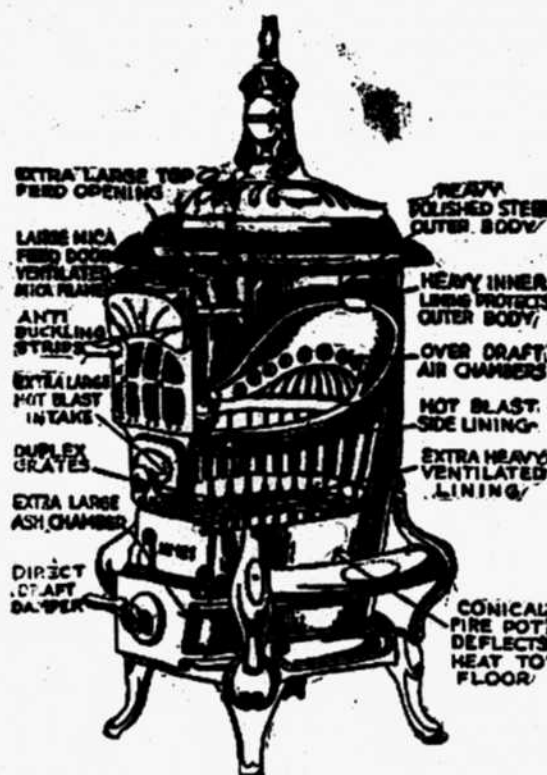
HOT BLAST HEATER

We are showing here a few of our standard goods. Of course you know that these are only a very small part of our big stock. Their prices are some higher than they were two years ago, but still they are priced at figures much lower than many dealers are charging and lower than we will be obliged to charge when the present stock is exhausted.