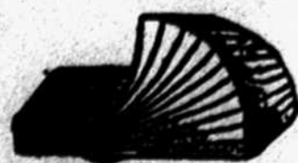
Big Values in Felt Mattresses