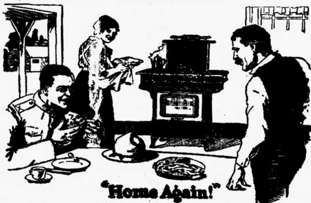
DETROIT VAPOR-Wickless, Kerosene-burning, Cook Stove. Best on Earth—While Present Stock Lasts.....$78

Butler Brothers will be delighted to show you their store. They want you to go through its four great floors filled with the best goods they have been able to pick from the markets of the world. Even if you do not want to buy now, you will enjoy seeing the store. You can find it easily. It is the big red brick building at the corner of Broad and Wilson.