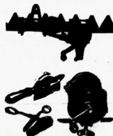
Best on Market Priced from ...$4.00 to $8.00