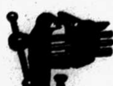
Vises .....$1.50 to $4.50

Your visit to Dunn will not be complete if you fail to visit us. Our store is one of the town's show places. It will be a genuine delight to us to be permitted to show you all over it. We will welcome you, whether you come to buy or just to look. Our salesmen want to see you—Don't disappoint them.