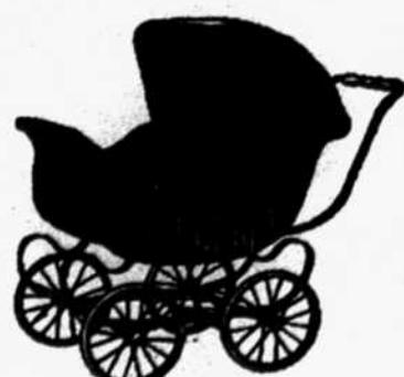
Baby Carriages .....$50 to .....$85