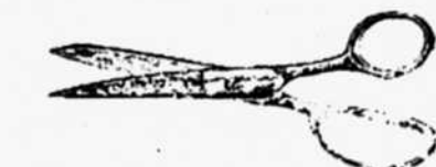
Shur Edge Scissors $1.50 to .....$2.50