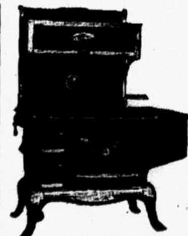
Mascot Ranges $85 to .....$90