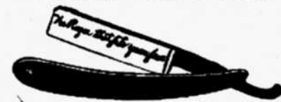
Shur Edge Razors...$3.50 to .....$4.00