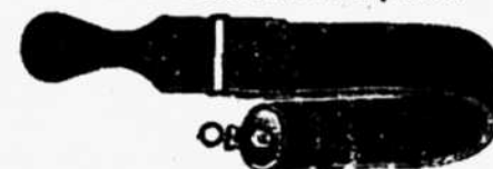
Pike Razor Straps...$1.50 to .....$2.25