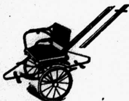
Pull Cart .....$16.50 to .....$35.00