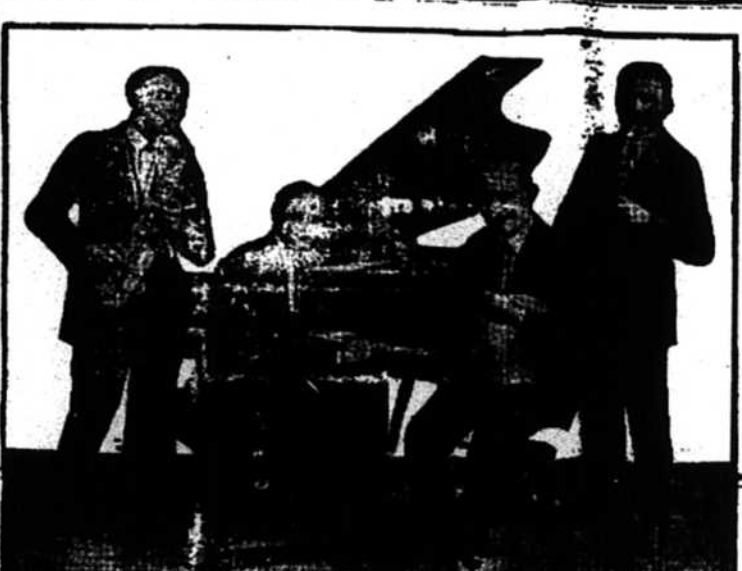
MARION MALE QUARTET