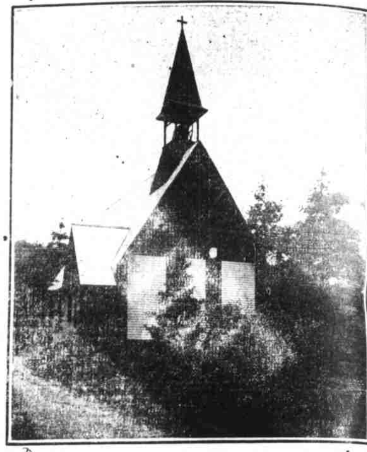
Episcopal Church, Haywood Street

The community is well served by these five churches. The community is fortunate in having these five churches, which provide a rich religious life for all who live in the community.