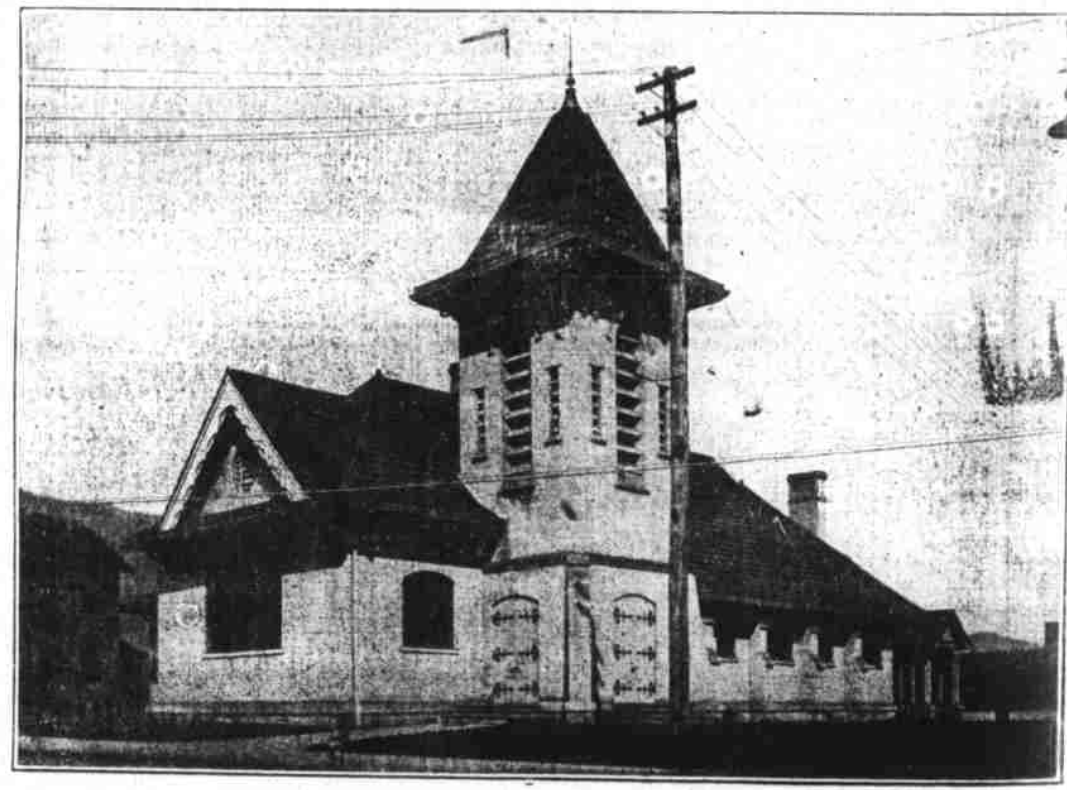
Presbyterian Church, Main Street