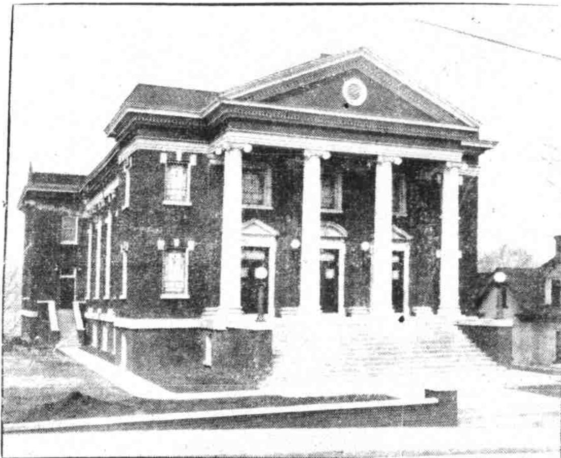
First Methodist Church, Haywood Street