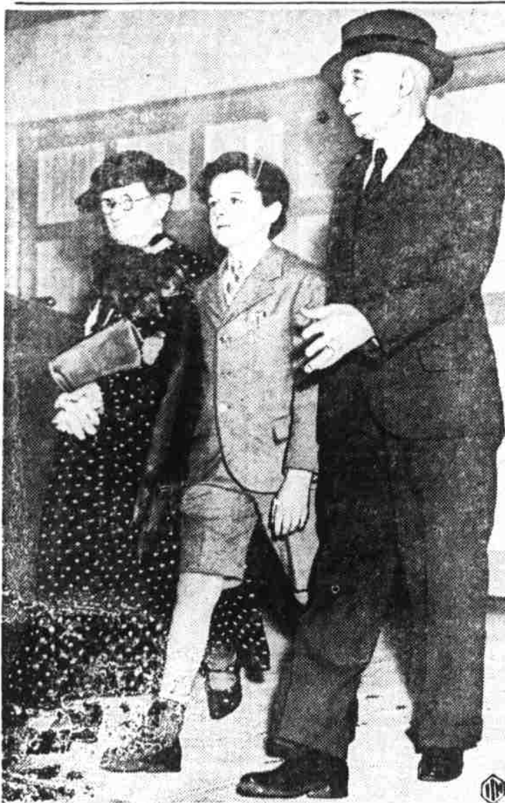
Freddie Bartholomew and grandparents