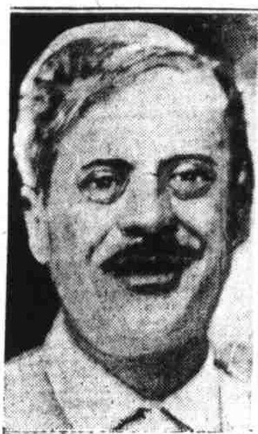
Baron Eugene Rothschild

It is generally conceded that the most powerful woman in Italy and one of the most powerful in Europe is the Countess Edda Clano, wife of Italy's Foreign Minister and daughter of Premier Mussolini. Last week the countess completed plans for her first