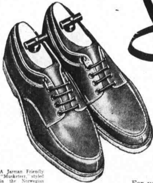
A Jarman Friendly "Munketeer," styled in the Norwegian manner. In Brown, Noddy, Calf $5