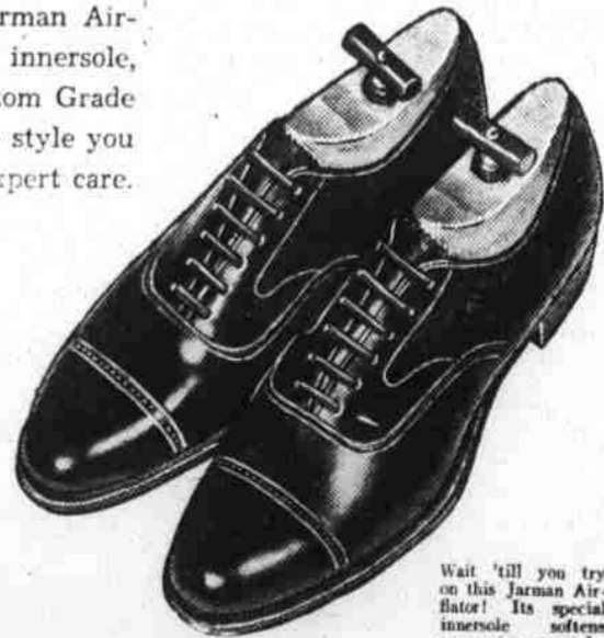
Wait 'till you try on this Jarman Air-flator! Its special innersole softens every step you take . . . fits automatically to the hollows on the bottom of your foot! . . . $6.50