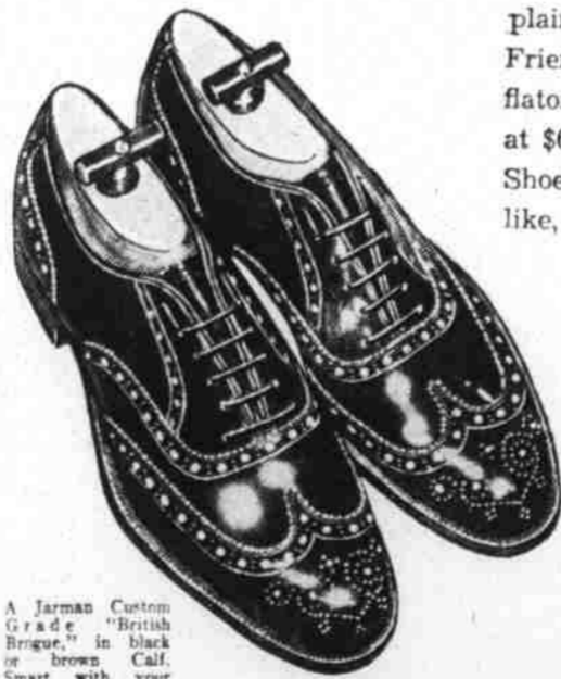
A Jarman Custom Grade "British Brogue," in black or brown Calf. Smart with your tweeds or coverts $7.50

For your Fall shoes, come in and look over our new Jarman styles. Every new shoe style trend is represented in our Jarman stock — new leather tones, new brogues, crepe soles, plain toes, straight tips — in the Jarman Friendly Shoe at $5 . . . the Jarman Air-flator, built with a special cushion innersole, at $6.50 . . . and the Jarman Custom Grade Shoe, at $7.50. We'll show you the style you like, and fit it to your foot with expert care.