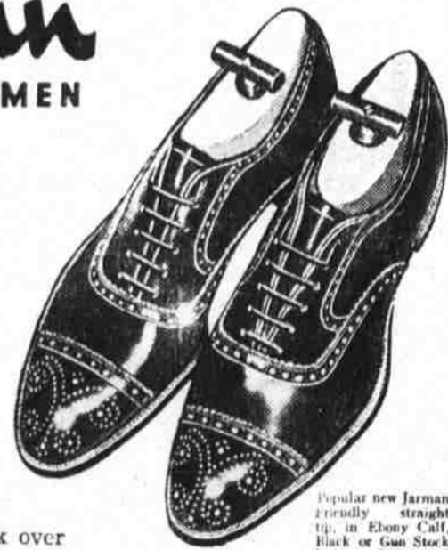
Popular new Jarman "readily straight tip" in Ebony Calf, Black or Gun Stock Brown Calf...$5

For your Fall shoes, come in and look over our new Jarman styles. Every new shoe style trend is represented in our Jarman stock — new leather tones, new brogues, crepe soles, plain toes, straight tips — in the Jarman Friendly Shoe at $5 . . . the Jarman Air-flator, built with a special cushion innersole, at $6.50 . . . and the Jarman Custom Grade Shoe, at $7.50. We'll show you the style you like, and fit it to your foot with expert care.