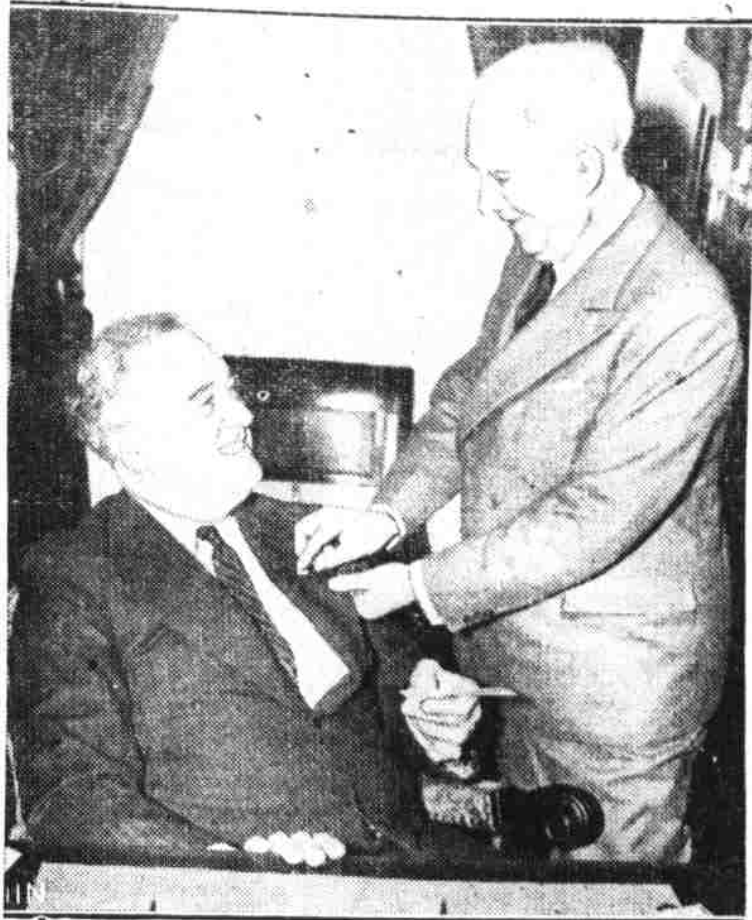
President Roosevelt and Norman H. Davis Chairman Norman H. Davis of the American Red Cross enrolls President Roosevelt into the membership as the national drive gets under way in Washington.