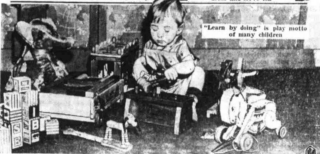
"Learn by doing" is play motto of many children

These scenes were taken shortly after the break of dawn on Christmas morning, and proves beyond a shadow of a doubt that Santa Claus did make his annual visit to some homes at least.