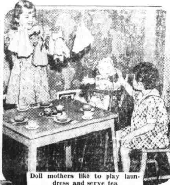
Doll mothers like to play laundress and serve tea