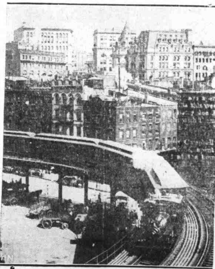
The "El" in operation in olden days

After 60 years New York's Sixth avenue elevated passes out of existence, to be replaced in 1940 by a subway. Few recall the "El" when it was hauled by steam locomotives. Here's a picture, printed through the courtesy of the Museum of the City of New York, showing the "El" in the old days, with a steam locomotive hauling a load uptown.