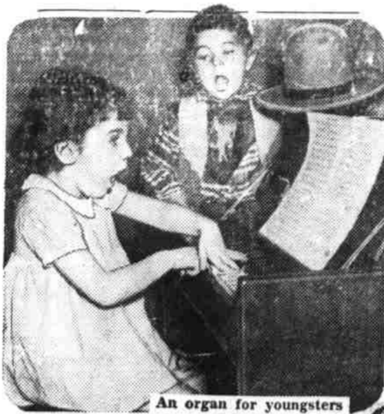
An organ for youngsters