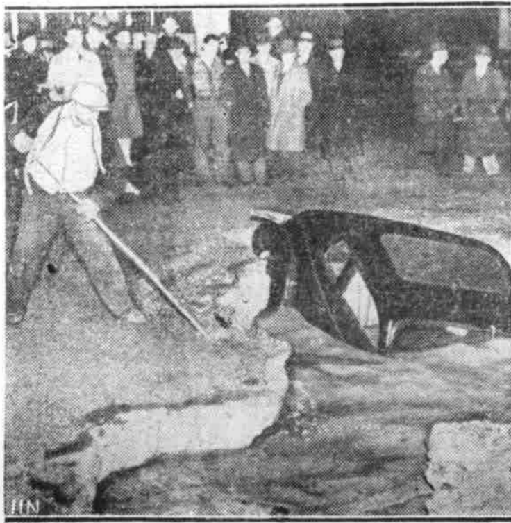
How parked car sank on street

Imagine the surprise the owner of this automobile received when he returned from a restaurant in New York to find his auto, which he had parked but an hour before, in this condition. Another auto struck a fire hydrant in Flushing, breaking it at the base. The resultant flood undermined the street, plunging the parked auto into this flooded hole.