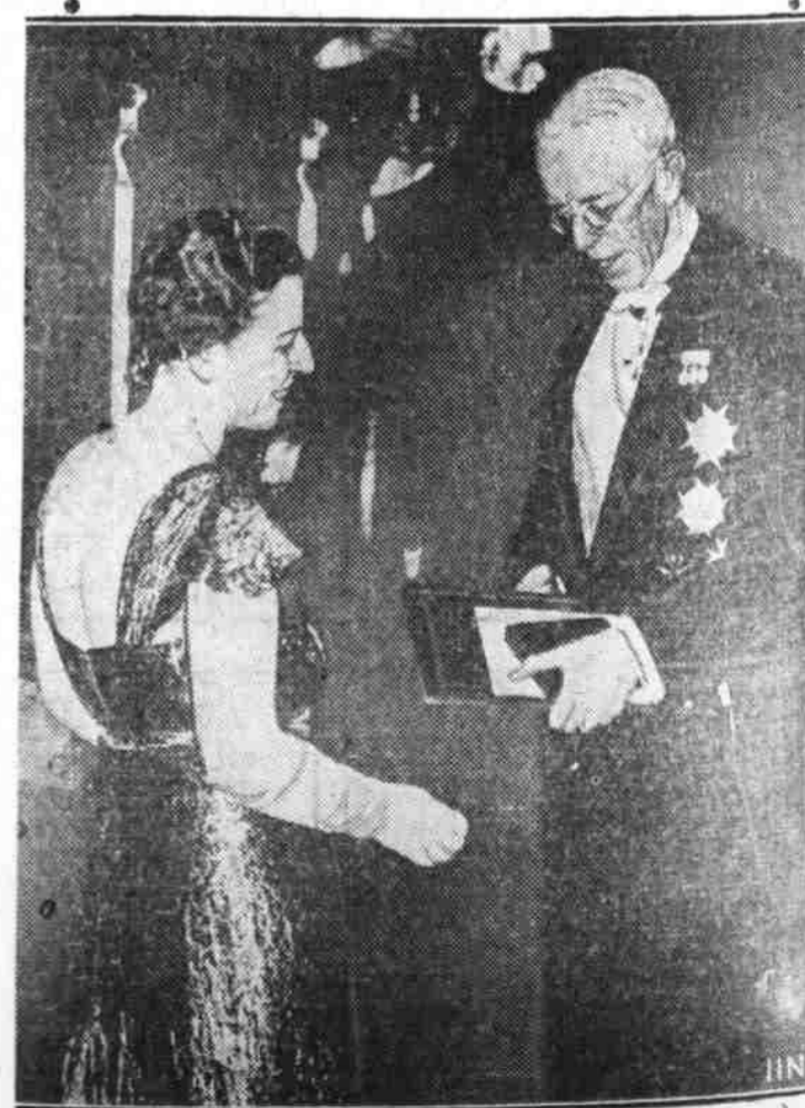
Pearl Buck and King Gustav

In a brilliant ceremony in the Stockholm concert house, Pearl Buck, American writer, receives from King Gustav V of Sweden the 1938 Nobel prize in literature. Mrs. Buck received a parchment certificate bound in tooled leather, the Nobel medal and a check for an amount equal in American money to about $37,700.