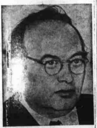
Famed author Franz Werfel, who at various times had been reported in a concentration camp, shot and beheaded because of his anti-Nazi writings, is shown as he arrived in Hoboken, N. J., after escape from Nazi-occupied France. He was among fifteen German men of letters who came in on the Greek liner, Nea Hellas .

dictators know right now, that we stand united and fore-square behind the Foreign Policy of Franklin D. Roosevelt, and will continue to do so until the wicked reign of dictators is no longer a menace and threat to American freedom and American security. Be sure that your vote will not give one iota of aid or comfort or encouragement to the dictators on election day.