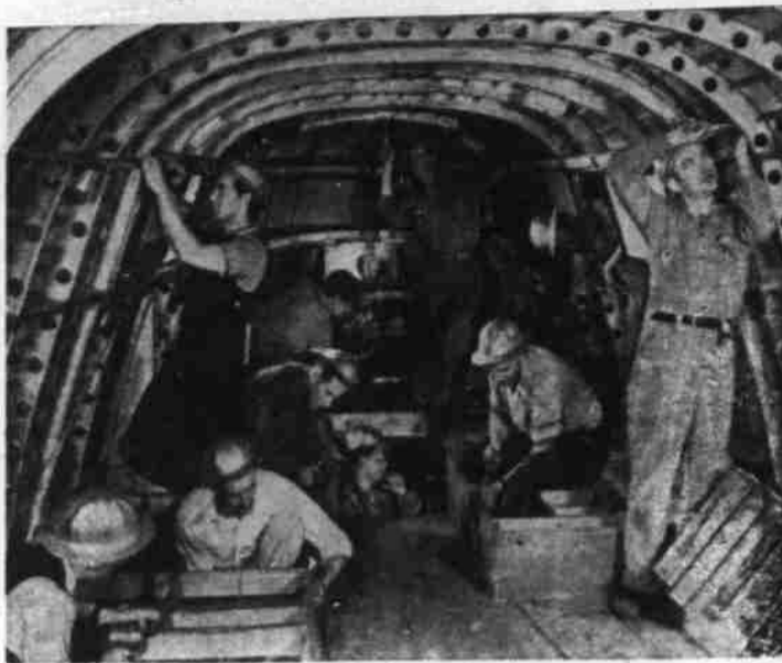
This looks like a vehicular tunnel, but actually it is the pilot's compartment of the 80-ton Douglas B-19 bomber, world's largest airplane, which is nearing completion in Santa Monica, Calif. The $2,000,000 craft will have the greatest load-carrying capacity, longest flight range and most powerful armament of any sky ship ever built.

the American Legion committee, made a short talk on pro-Americanism. He said that growing food for every family was the right kind of propaganda. He assured the group that the American Legion would back the program.