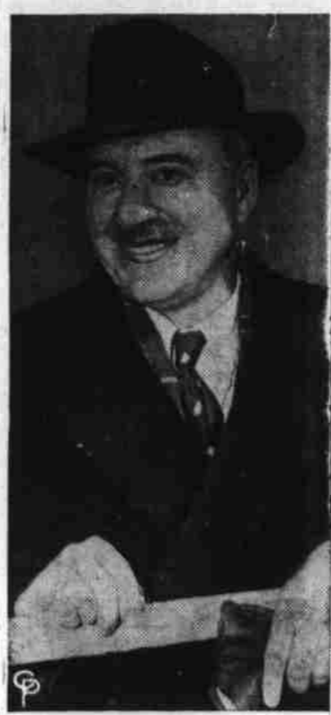
Surgeon-General Thomas Parran returns to the United States aboard the Excalibur , arriving at New York from Lisbon. General Parran studied medical conditions in England, declared there is a vital need for American nurses, doctors and hospital equipment.

Weight of Cotton Bale The average weight of a bale of cotton in the United States is around 500 pounds.