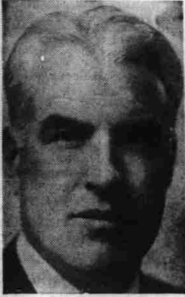
Appointment of Lend-Lease Administrator Edward R. Stettinius, Jr., as a Presidential assistant is seen as a move to slash red tape in speeding war-aid deliveries. Stettinius will now have power to sign the President's name to allocations not exceeding $300,000,000 each.