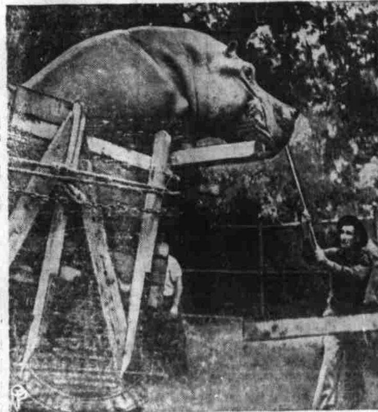
Keepers at Brackenridge Park Zoo in San Antonio, Tex., trying to move Punchie, the hippopotamus, to a new home, found that the 7,000-pound beast quite definitely didn't want to leave. He's shown almost upsetting the truck as he tries to leap over the side and return to his old abode. The keepers won out only after a seven-hour battle.