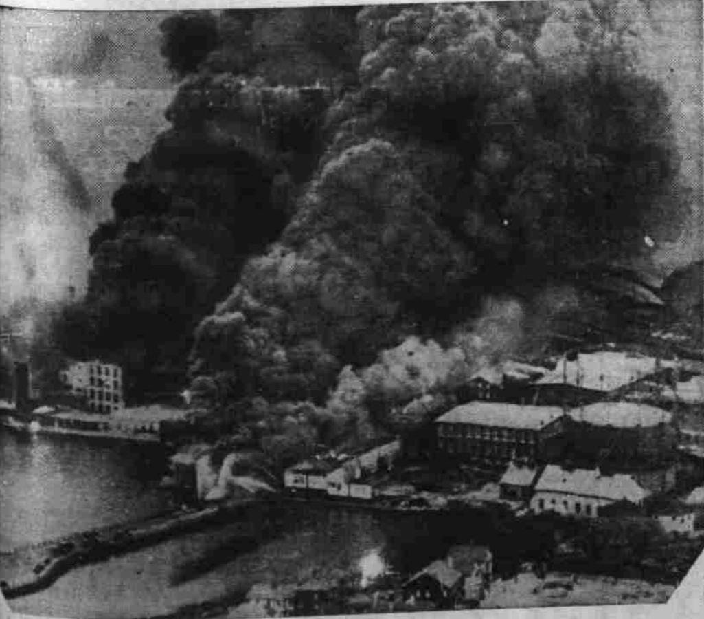
Propelled by repeated explosions raged out of control in four plants of the Firestone Rubber & Tire Corp., Fall River, Mass., as 1,000 workers fled the flames. This is an air view of the scene. Firemen from seven Massachusetts and Rhode Island cities helped battle the blaze, which for a time threatened the entire community. The company is engaged in defense work.