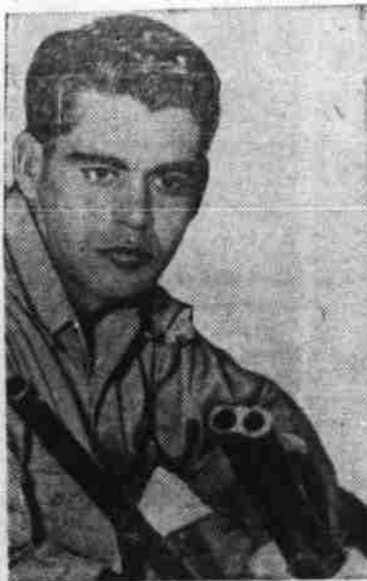
Checking over his hunting guns at his Frederick, Md., home is Charley Keller, New York Yankee slugger, who has plenty of time on his hands before spring training starts and the Yanks start their campaign for another world championship.