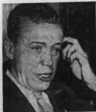
Undersecretary of War Robert P. Patterson appears before the House banking and currency committee and urges Congress to set up wage control as part of the federal price fixing program. He declared "only through price controls can we be assured of timely and adequate production to meet military needs."