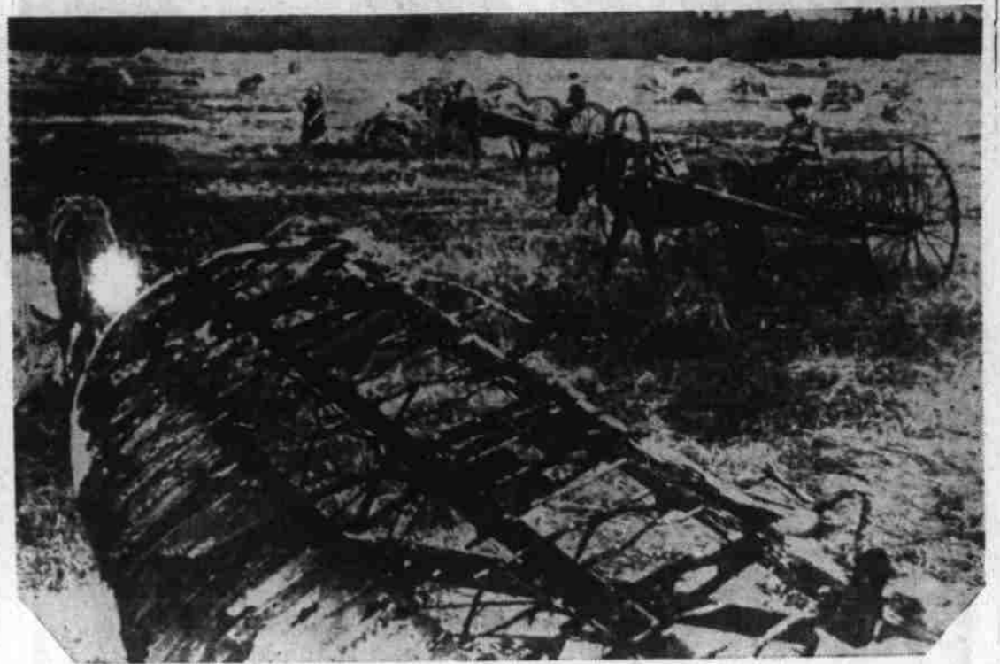
According to the official Russian caption with this photo, which was flashed by radio from Moscow to New York, the peasants of the Soviet are not allowing the war to interfere with their necessary work, and some of them are shown working in the field where a German plane has been shot down.