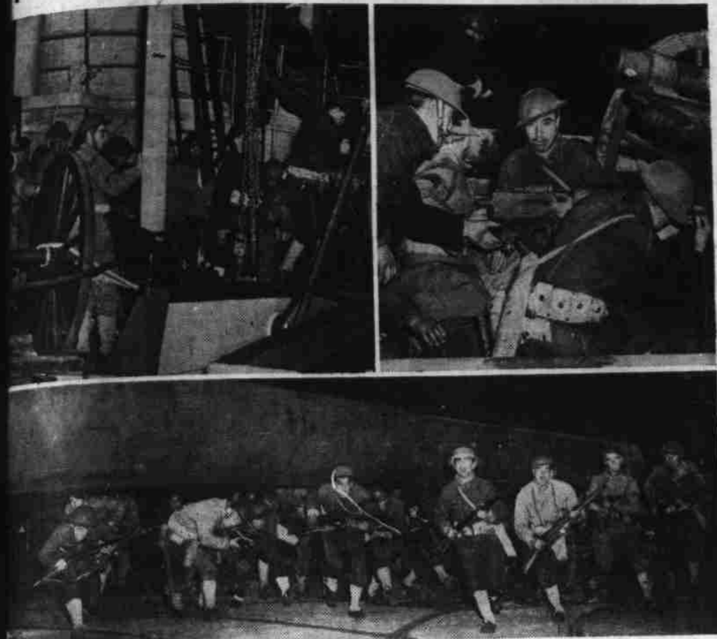
During the defenses of New York, the Black Army, a make-believe hostile force attempting theoretical invasion of the city with dive bombers, power boats and parachute troops, launched an attack on Fort Belvoir and succeeded in wresting the vital defense from the 24th Coast Artillery Regiment there. Top, army soldiers leap ashore from a unit of the invasion fleet. Top, right, they set up a machine gun in a captured field piece guarding entrance to the fort. Bottom, the invaders charge directly under the muzzle of a huge 16-inch rifle. After the capture, they turned it around to menace the city.