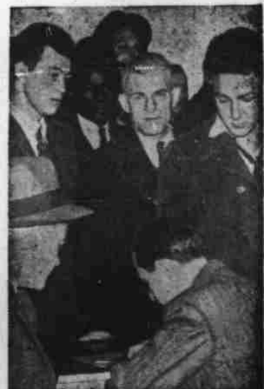
The slogan is "Remember Pearl Harbor" and these experienced shipyard workers do as they sign to go to the Hawaiian base. They answered an advertisement for several hundred men to repair damage wrought to vessels and facilities there.