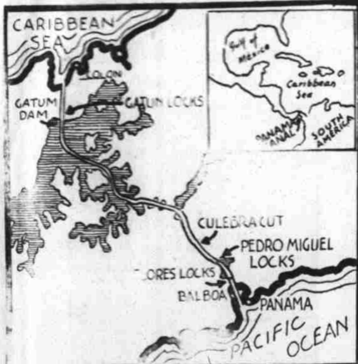
With unidentified planes reported in the vicinity of the Panama Canal, all defenses in the Canal Zone are being manned twenty-four hours a day. The best of America's pursuit planes are continuously flying patrol over the vital waterway that connects the Atlantic and the Pacific Oceans. Map shows course of the Canal. Small map shows relative location of the Canal.