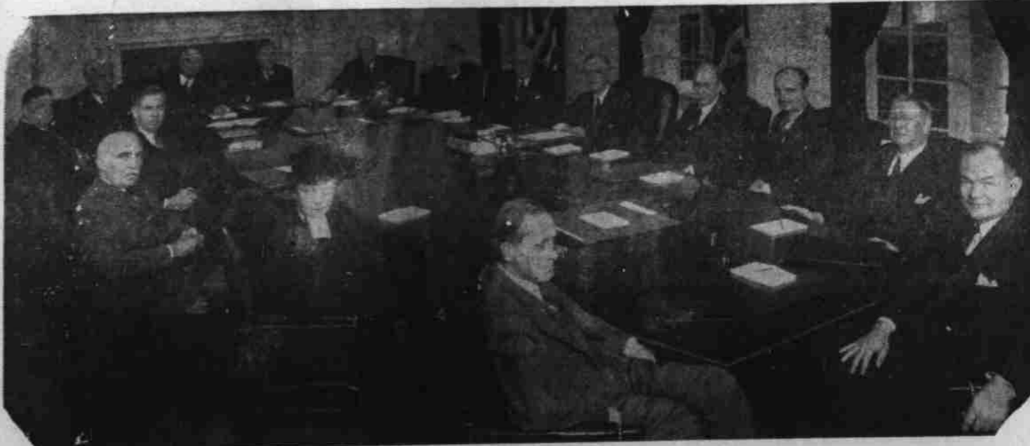
President Roosevelt meets with his war cabinet in the White House for the first time. Left to right around the table: Harry Hopkins, lend-lease administrator; Frances Perkins, secretary of labor; Col. Philip B. Fleming, federal works administrator; Vice President Henry A. Wallace; Fiorello LaGuardia, civilian defense administrator; Paul V. McNutt, federal security administrator; Jesse Jones, secretary of commerce; Harold Ickes, secretary of the interior; Postmaster General Frank C. Walker; Henry L. Stimson, secretary of war; Cordell Hull, secretary of state; the President; Henry Morgenthau, secretary of the treasury; Attorney General Francis Biddle; Frank Knox, secretary of the navy, and Claude R. Wickard, secretary of agriculture. The Cabinet will hold frequent sessions.