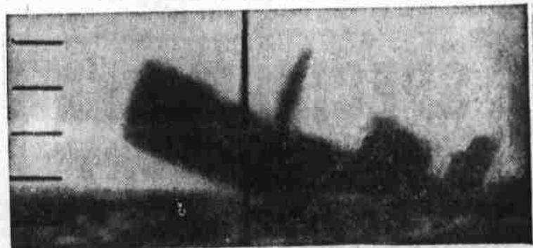
This view of a sinking Jap freighter was made through the periscope of a U. S. submarine after it had sent a torpedo banging into the side of the enemy ship. The bow points skyward just before the stricken vessel takes its final plunge. Since Pearl Harbor, U. S. subs have sent at least 107 Jap ships to the bottom.