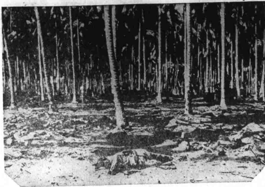
The photo was taken after the battle of Tenaru River on Guadalcanal in the Solomons. Dead Japs sprawl in the foreground and at left, while in the midst of the palms Marines clear up the battlefield with tanks. Japs are locked in combat once again on Guadalcanal with U. S. forces in a battle to regain the strategic airport on the large island.