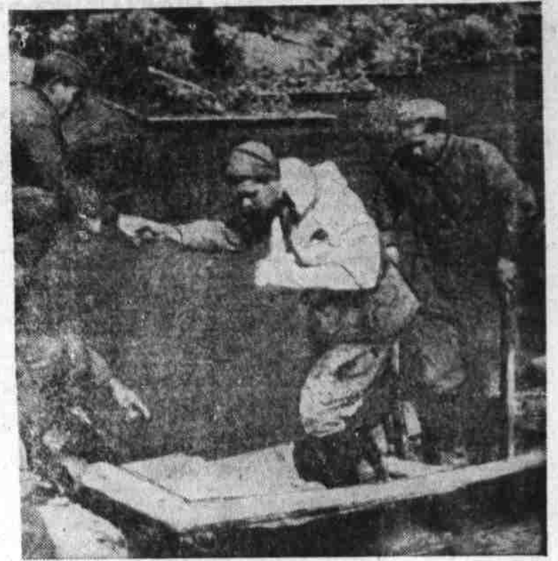
A couple of Soviet soldiers wounded in the long siege of Stalingrad are shown after they were rowed across the Don River from the fighting line. Medical corps soldiers help them out of the boat before driving them back to a base hospital. Because of the heroic fighting of such men as these, the Nazis have been unable to capture the key city and have suffered huge losses in men and equipment.