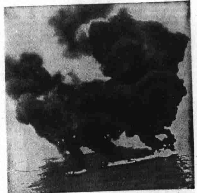
Black clouds of smoke are shown pouring from the remains of a Japanese four-motored bomber of the Kawanishi type in the Southern Pacific after being mortally hit in a battle with one of our Flying Fortresses. U. S. fliers in the Solomon Islands sector have shot down 127 Jap planes in the last month.