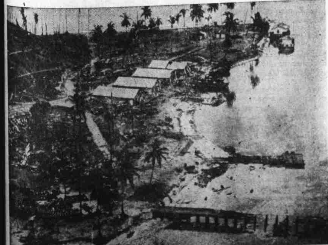
This is an aerial view of E. Tanabago Island in the Solomons, after U. S. planes had given it a terrific bomb blasting. Note the wrecked pier in the foreground and damaged fronts of the buildings. This attack was launched during the drive to oust the Japs from the Solomons. The Nipponese are making a desperate bid to recapture Guadalcanal island from which they were driven by the U. S. Marines.